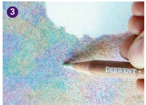
Image 3 shows the Blending Pencil being used to blend/mix three colours together in a background made up of three Coloursoft colours.

A blending pencil is used to blend/ mix the colours together on the paper. It has the advantage that more colour can be added over the top as it does not act as a resist. It also leaves a matt finish rather than a sheen finish.